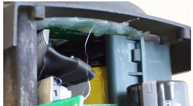
Imitators use, what looks like, big globs of hot glue to secure components.