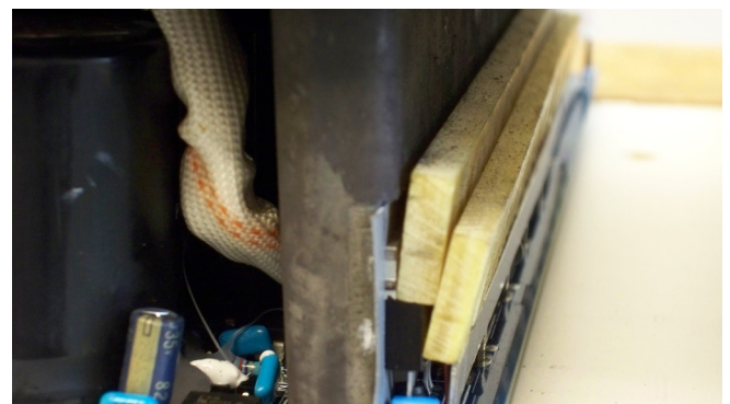
Poorly-assembled products use plastic wedges as a fix agent for spacing problems.

These deficiencies and general quality issues have compelled OutBack Power to issues this service bulletin and warning.