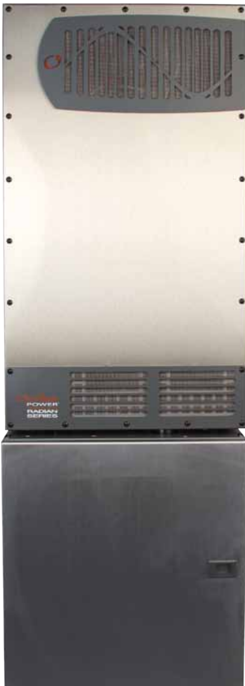
Radian Series Inverter/Charger with GS Load Center

With all the hallmark features you've come to expect from the Radian inverter/charger , the expanded Radian family includes four models, seven operating modes and two advanced technologies , all adding up to unmatched performance, reliability, value and system flexibility.