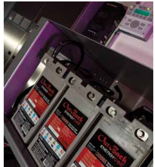
OutBack's Radian Series inverter/charger support both standard and advanced energy storage platforms.